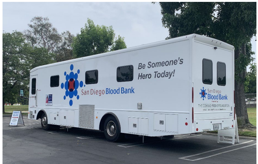
The Allied Gardens location added a Blood Drive to their Food Drive.

Community members donated food for the San Diego Food Bank and then headed over to the Blood Mobile where they donated 11 pints of blood to the San Diego Blood Bank (which will be used to save 33 lives).