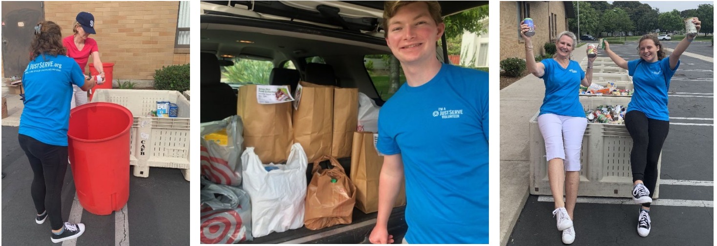
Members of JustServe Clubs from Helix Charter School and La Costa Canyon High School helped unload cars and fill collection bins at the "Neighbors Helping Neighbors" county-wide food drive on Saturday.

JustServe Clubs are currently being created in high schools all over San Diego County. Their motto is "BUILDING UNITY THROUGH COMMUNITY SERVICE"