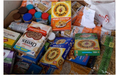
The Buddhist Temple of San Diego provided a much-needed drop-off location for the neighborhoods in central San Diego. Hundreds of pounds of food were gathered from this location.