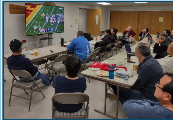
Sangha members take in the Super Bowl 57 Watch Party in the dining room on Feb. 12. Some were rooting for Philadelphia while others were cheering on Kansas City. More on back page.