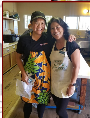
2022 Japanese Cultural Bazaar Thank You for Making It a Huge Success!