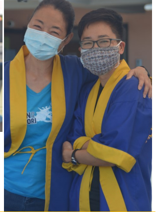
We gave out a BTSD pen with a memento of the day with hope you will document your family for our 100th.