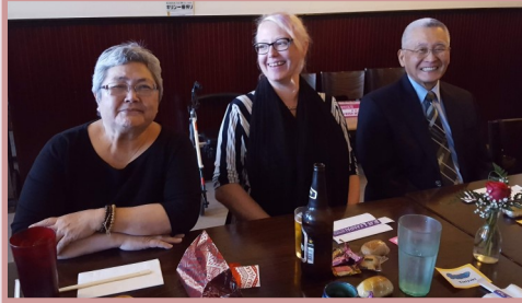
BWA Luncheon at Kanpai Restaurant